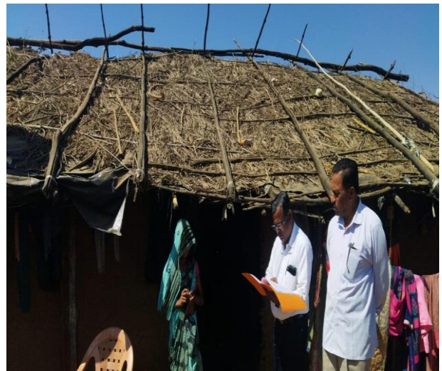
Unnamed Road, Maharashtra 425112, India Jalgaon Maharashtra India 2023-02-10(Fri) 11:59(AM)