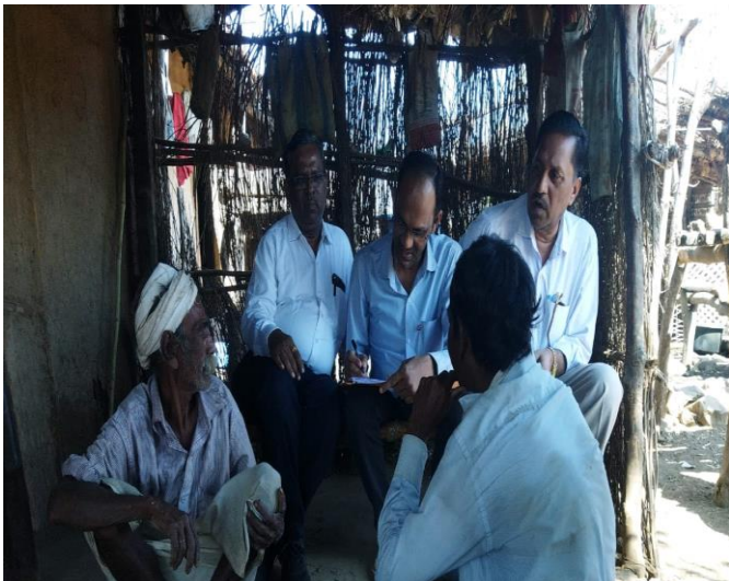
Unnamed Road, Maharashtra 425112, India Jalgaon Maharashtra India 2023-02-10(Fri) 11:45(AM)