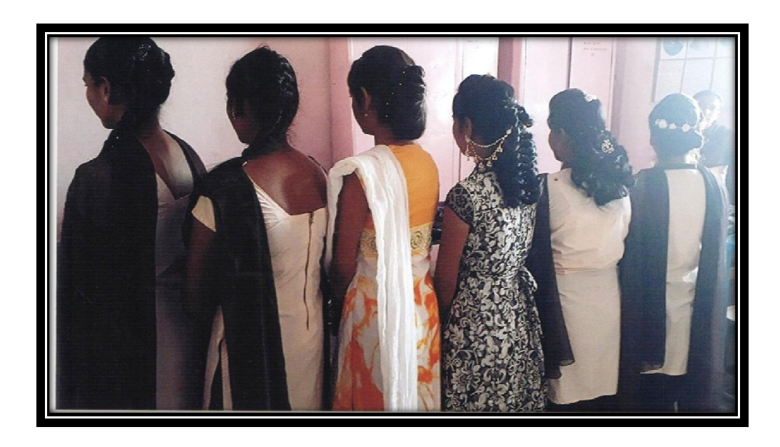
Student Participation in Keshabhusaha Competition